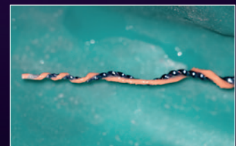
Root filling material removal during retreatment case