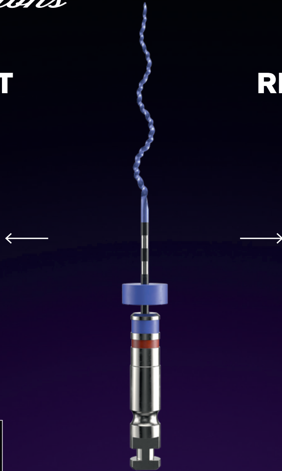
XP-endo ® Shaper