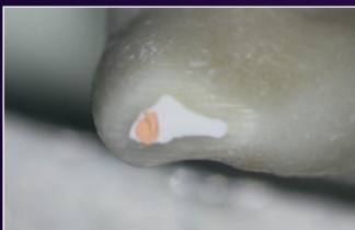
Cross-section 1 mm from the apex