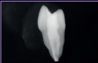
Radiograph showing the bucco-lingual aspect of the maxillary first premolar