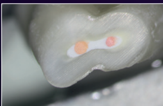
Cross-section 7 mm from the apex